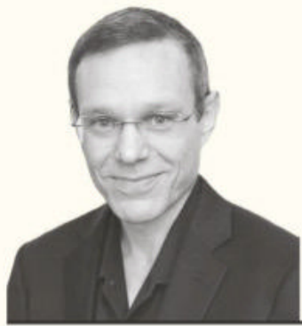
PROF AVI LOEB Theoretical physicist