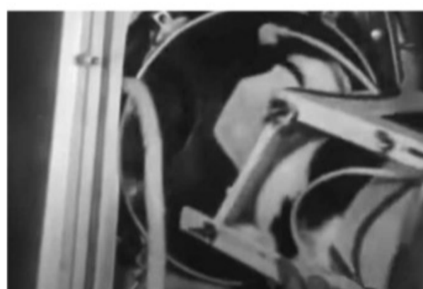
▲ The frame is fed into a windowless compartment the size of a large tin can

With C341 safely back on Earth it was time for France to let the world know about her flight – and finally she had a name too. In the absence of an actual name, the French media nicknamed the space cat Felix, after the naughty black and white cartoon cat from movies and television. But C341 was female, so CERMA took the nickname and changed it to the feminine version: Félicette.