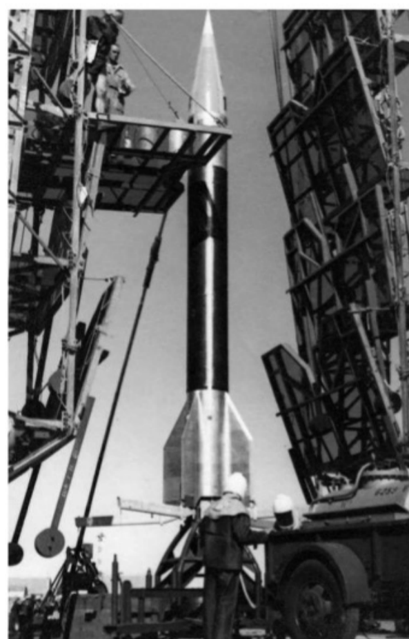
▲ The French Veronique AGI rocket was much smaller than any from the Apollo era

Sadly, like Laika's, Félicette's story did