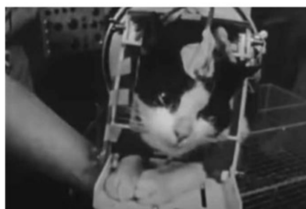
▲ Félicette is strapped into a launch seat to be loaded into the Veronique rocket

Leo This sprawling zodiacal constellation shines low in the east before dawn this month. It contains the Sickle asterism and hundreds of galaxies, including the famous Leo Triplet.