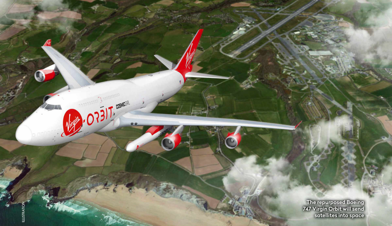
The repurposed Boeing 747 Virgin Orbit will send satellites into space