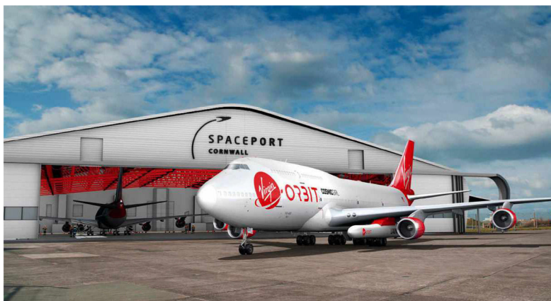
▲ Once at altitude, the plane will release its satellite-bearing rocket

Also on board, in another first, is the Sultanate of Oman's first-ever satellite, AMAN, for Earth observation. A further Polish satellite is also to be deployed as part of SatRev's STORK constellation for Earth observation.