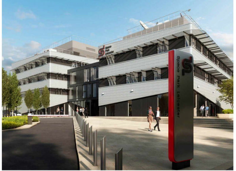
▲ Space Park Leicester, where university research and business expertise meet

As well as small companies, start-ups and university spin-offs, some aerospace giants such as