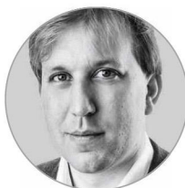
Prof Chris Lintott is an astrophysicist and co-presenter on The Sky at Night

And yet there is still tension. One possibility is that Hubble may be systematically wrong in its measurements of Cepheids, with contamination