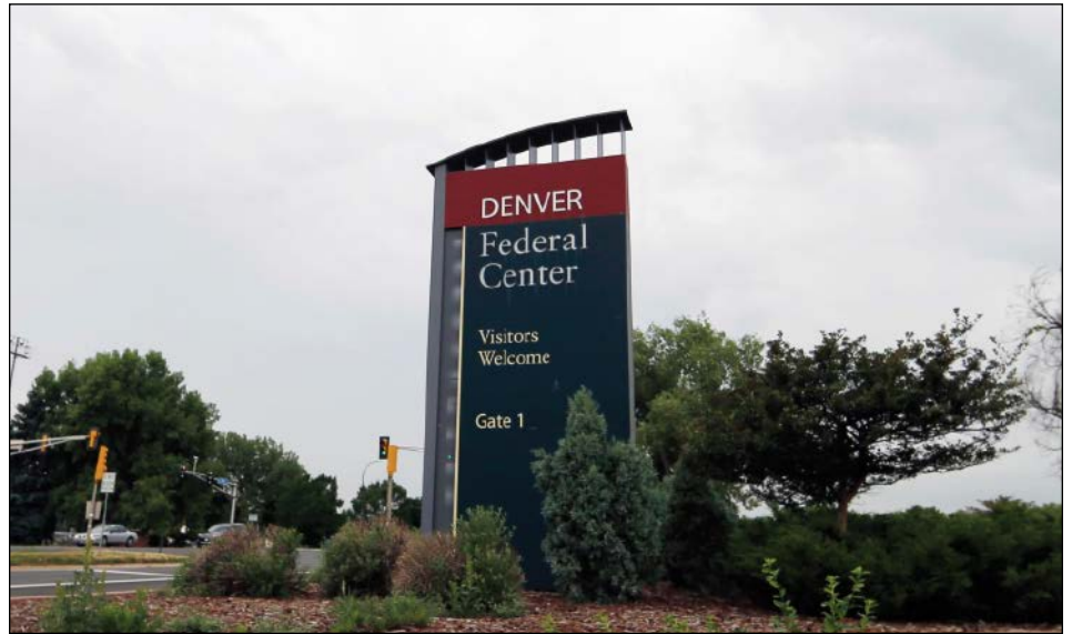
The main entrance to the Federal Center in Lakewood, Colo., where the inorganic section of the Energy Geochemistry Laboratory was located until the lab closed this spring. The U.S. Geological Survey found evidence of scientific misconduct in the lab section.