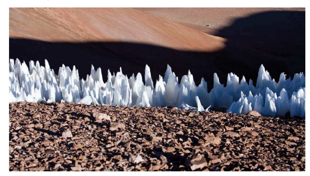
Penitentes in the Andes mountains in Chile.

"We hypothesize that penitentes can grow, and indeed have grown [on Europa]," the researchers write in their study, which was published in Nature Geoscience in October (http://bit.ly/europa-penitentes).