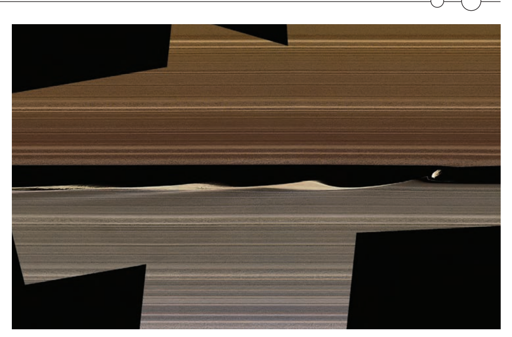
The embedded moon Daphnis creates three waves in Saturn's rings in this image taken by the spacecraft Cassini during its grand final .

"We found a number of things that are new—a number of structures that we'd never been close enough to see before."