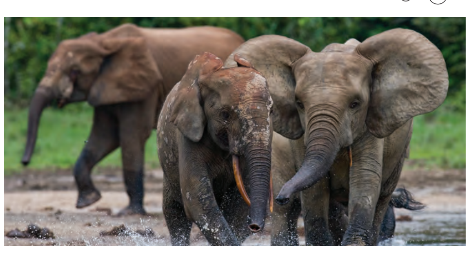
Forest elephants splash and play at a forest's edge in the Dzanga-Sangha Special Reserve in the Republic of the Congo.

tropical rain forest drapes over central Africa in the Congo Basin, covering an area 3 times the size of Texas. The forest is the second-largest tropical forest in the world, behind only the Amazon in South America.