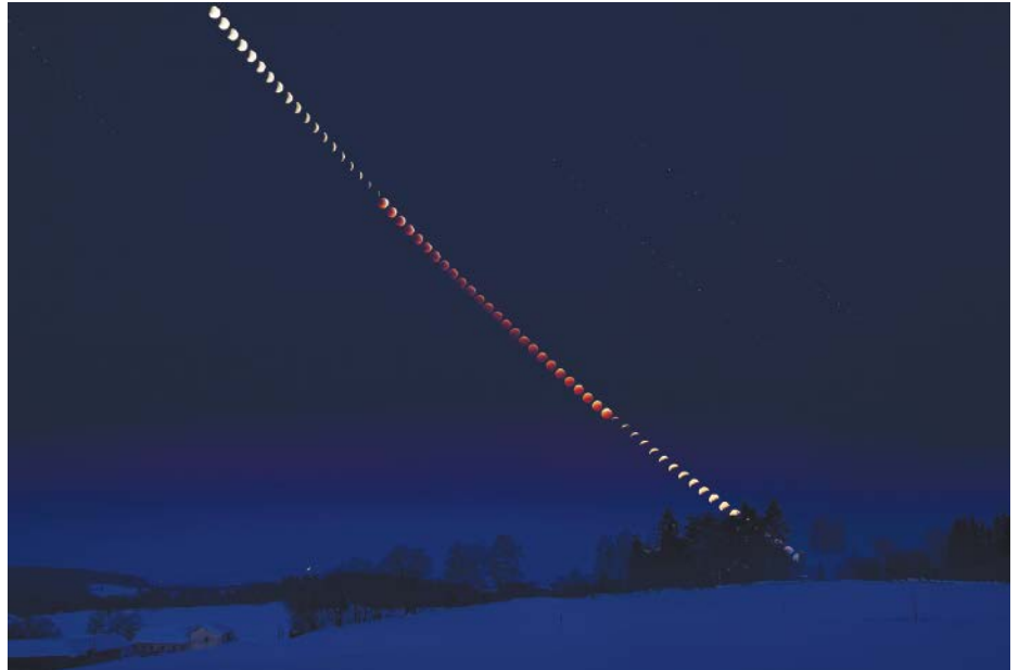
During a total lunar eclipse, the Moon travels first through the umbral (orange) and then the penumbral (red) shadow of the Earth, becoming progressively darker and redder before returning to normal. This is a composite of a sequence of images of the 21 January 2019 total lunar eclipse as seen in Austria.

Last year’s so-called super blood wolf moon gave astronomers the chance to measure the spectrum of Earth’s atmosphere as if it were a transiting exoplanet, a feat that is possible only during a total lunar eclipse.