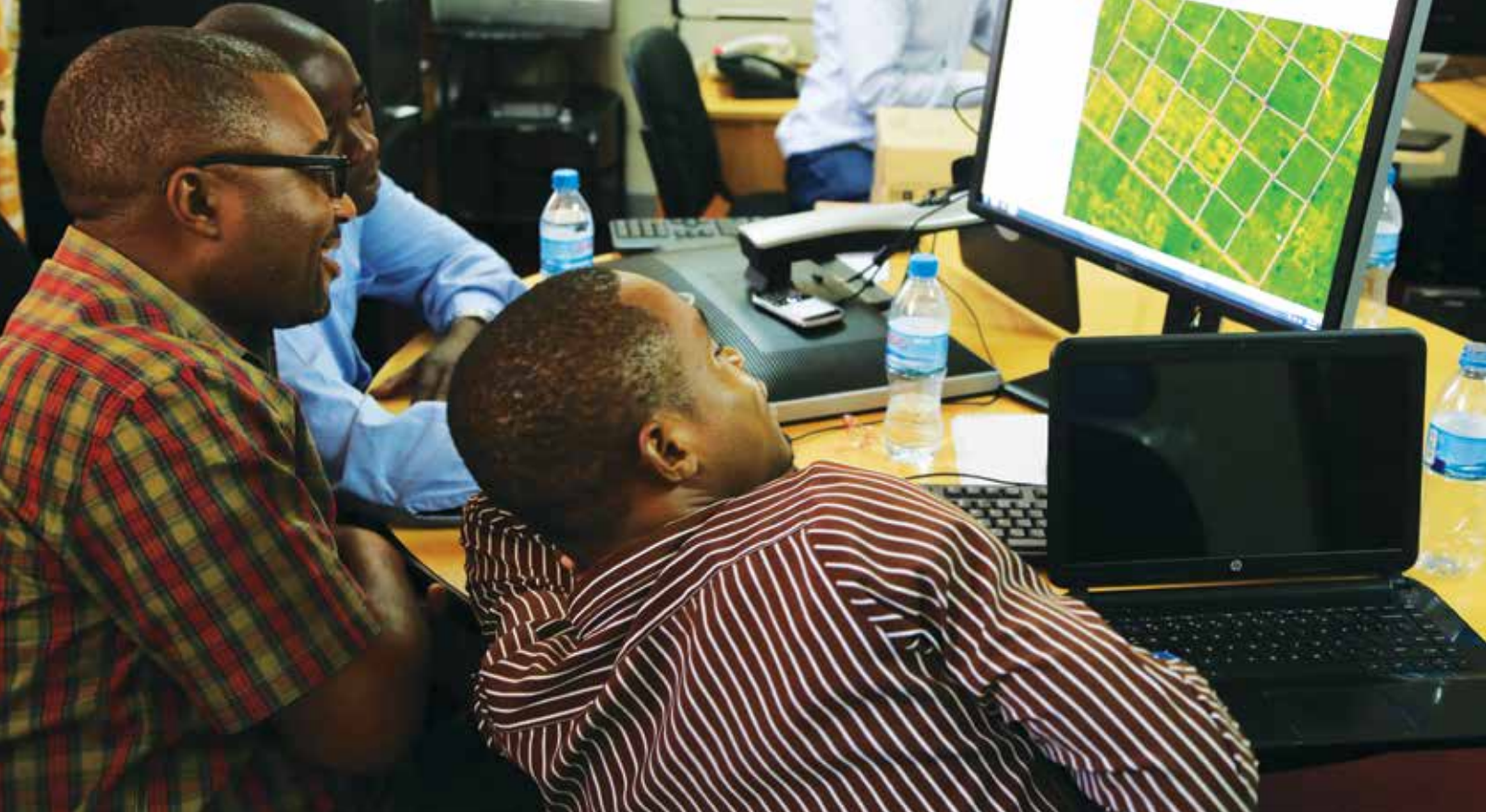
Officials from Tanzania's Ministry of Agriculture examine field boundary delineations to be used in an agriculture monitoring scheme.

A satellite-based Global Agriculture Monitoring system developed by the University of Maryland in partnership with NASA and the U.S. Department of Agriculture was customized for East Africa, enabling implementation of the World Bank's Disaster Risk Financing and Insurance Program. In Uganda, this program has supported more than 300,000 individuals in the Karamoja region, providing alternative livelihoods to smallholder farmers affected by drought.