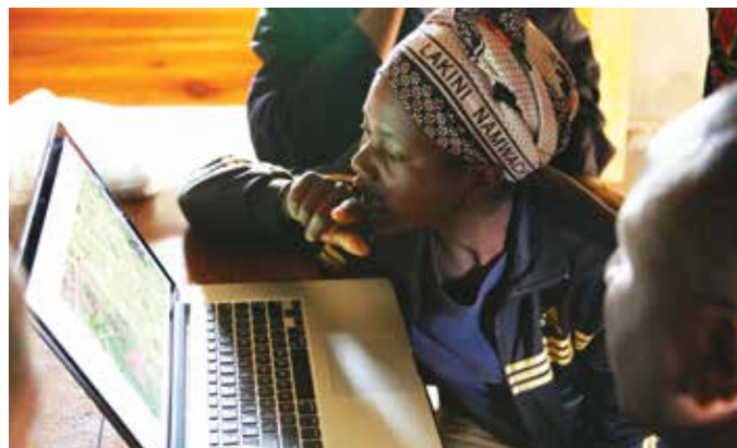
A farmer guides a data collection team during fieldwork in Njombe, Tanzania.

In sub-Saharan Africa, agricultural system shocks in coming years will continue to have severe impacts on the food security of small-holder farmers. Analyzing the nature and extent of these impacts and