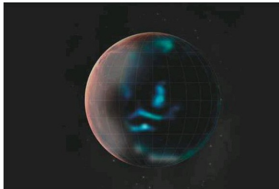
An artist's impression of Mars' Discrete Aurora.

The ghostly glow known as Discrete Aurora is an intricate pattern that traces out the regions where Mars' enigmatic