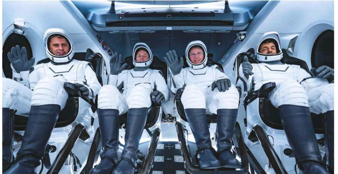
Emirati astronaut Sultan Al Neyadi (far right) is a picture of confidence during the static fire test of the Falcon 9 rocket and dry rehearsal for Crew-6 members headed to the International Space Station yesterday.

During the mission, Al Neyadi will conduct a series of advanced experiments to arrive at important scientific results about outer space and participate in an awareness and educational programme involving