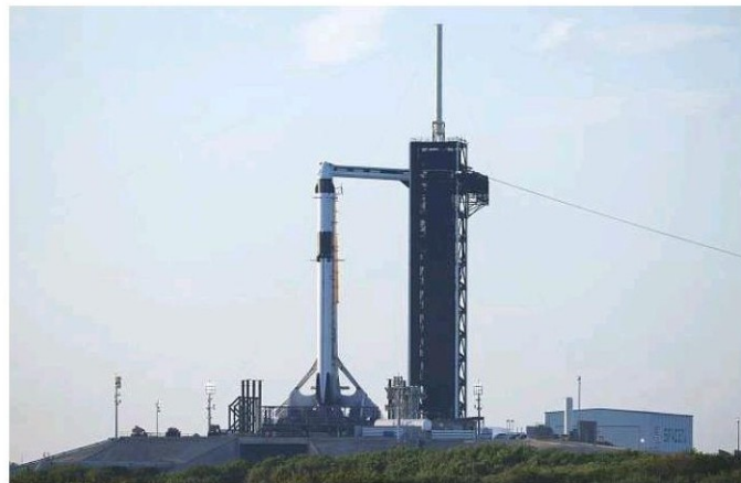
UAE astronaut Sultan Al Neyadi (2nd right) with his fellow crew members. Left: The Falcon 9 rocket is rigged to the launchpad with the Endeavour capsule perched atop it.