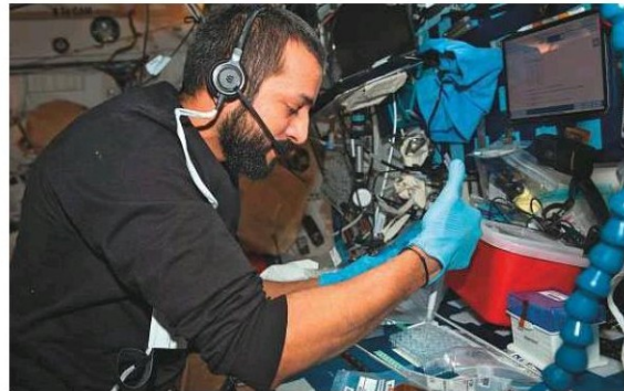
■ Sultan Al Neyadi is the longest-serving Arab astronaut, having spent over 3 months aboard the International Space Station.