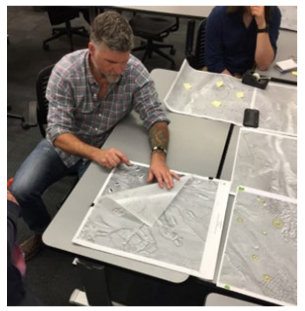
Figure 1: USGS staff teaching a university level workshop on planetary GIS and geologic mapping. (2022)

that might not excel in the traditional subjects such as language or mathematics, and students who might be facing difficult circumstances inside or outside of school a haven to let art and science be their creative outlet [21, 22]. Not only does this provide healthy coping mechanisms and instill an appreciation for STEAM in the growing generations, but if paired with visually stimulating STEAM products, such as geologic maps, it also allows for a low-barrier entry of interest in the sciences.