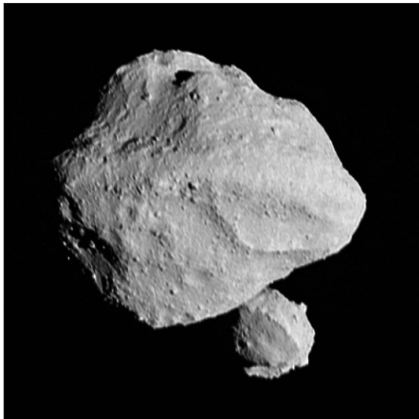
Figure 1: A L'LORRI image of the Dinkinesh system taken near the moment of close approach. The spacecraft was roughly 430 km from the primary. The geometry of the encounter was such that the satellite, Selam, passed behind Dinkinesh. Ecliptic north is approximately up.

Fig. 1 and 2 show two images of the Dinkinesh system taken within a few minutes of close approach.