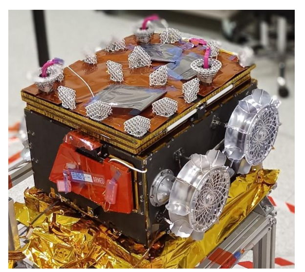
Figure 2 Rover Flight model in cruise configuration

Mission Status: The qualified IDEFIX Rover has been delivered from Europe to Japan in early 2024. It will be integrated into the main spacecraft and will undergo further tests on spacecraft level. The current MMX schedule has a launch date in JFY 2026, followed by Martian orbit insertion in JFY 2027 and the