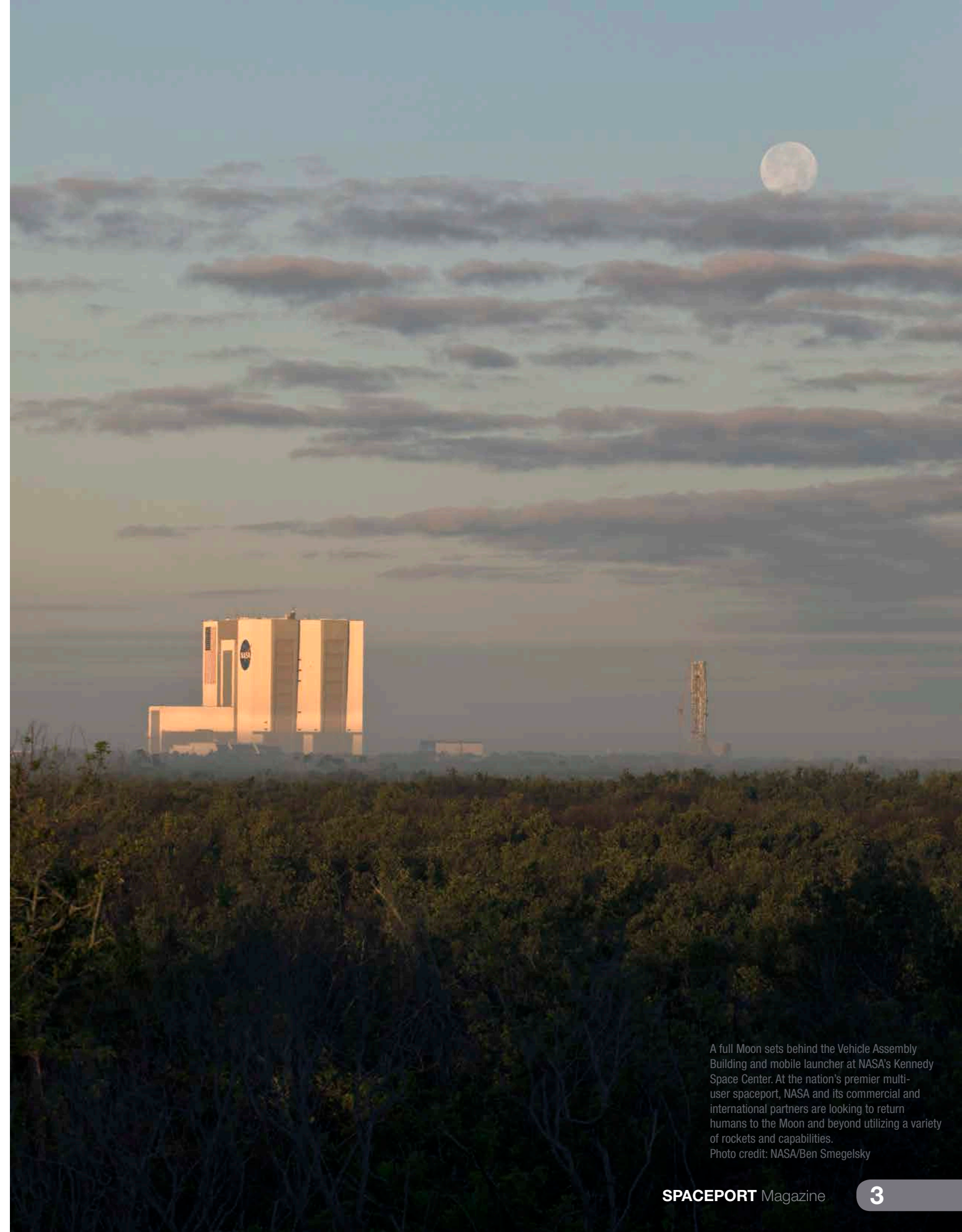
A full Moon sets behind the Vehicle Assembly Building and mobile launcher at NASA's Kennedy Space Center. At the nation's premier multi-user spaceport, NASA and its commercial and international partners are looking to return humans to the Moon and beyond utilizing a variety of rockets and capabilities.