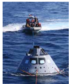
Cover: As part of Underway Recovery Test 6, the Orion test article is pulled in by a winch line at the rear of the USS Anchorage's well deck Jan. 18, 2018, in the Pacific Ocean.

For the latest on upcoming launches, check out NASA's Launches and Landings Schedule at