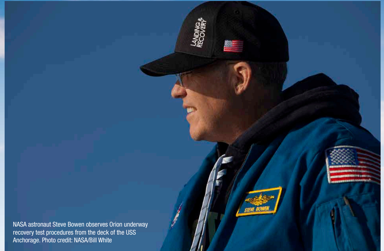
NASA astronaut Steve Bowen observes Orion underway recovery test procedures from the deck of the USS Anchorage.

"We train in day, night, rough seas and calm seas, because we don't know what we're going to get. My guys have to be on their game and know exactly what to do, no matter what issue we encounter during the recovery."