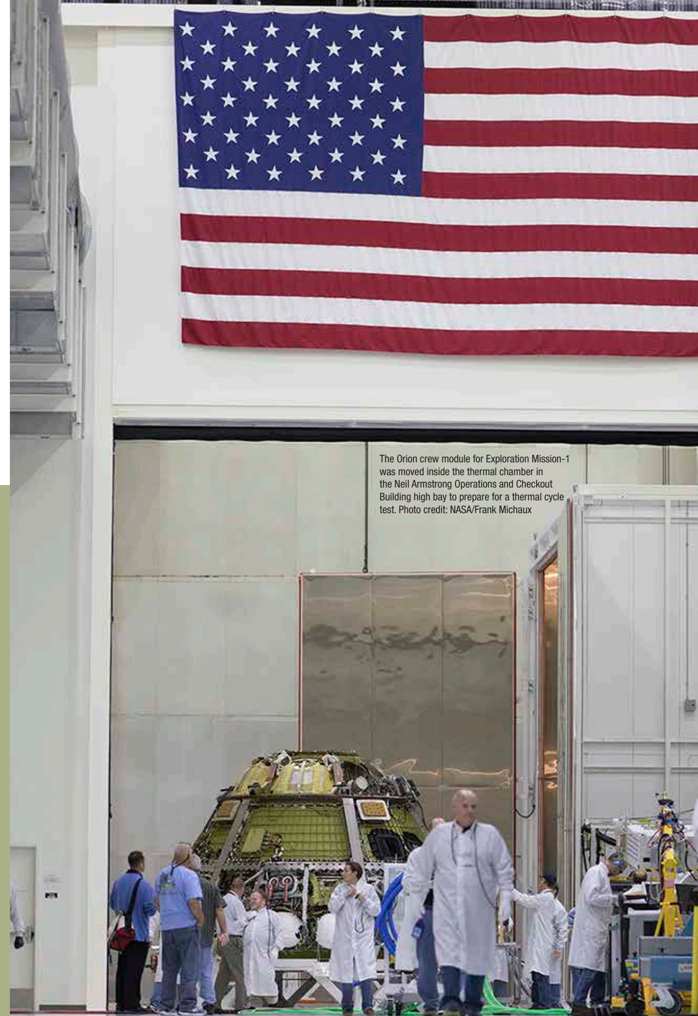
The Orion crew module for Exploration Mission-1 was moved inside the thermal chamber in the Neil Armstrong Operations and Checkout Building high bay to prepare for a thermal cycle test.