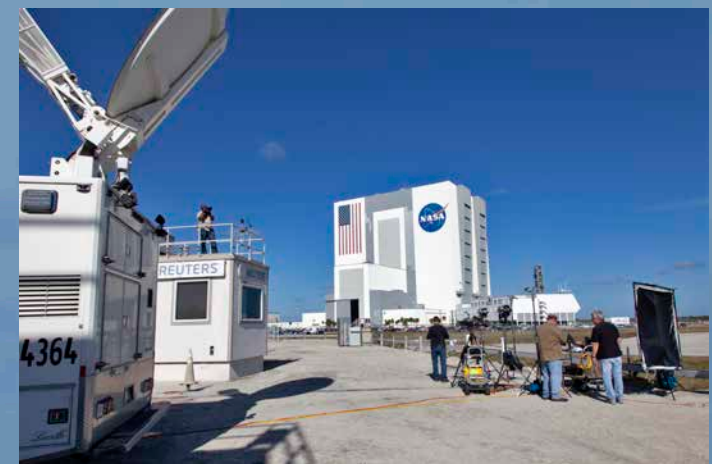
Employees, invited guests and members of the news media gathered to witness the liftoff of the SpaceX Falcon Heavy rocket from Launch Complex 39A. The demonstration flight is a significant milestone for the world's premier multi-user spaceport. In 2014, NASA signed a property agreement with SpaceX for the use and operation of the center's pad 39A, where the company has launched Falcon 9 rockets and is preparing for the first Falcon Heavy. NASA also has Space Act Agreements in place with partners, such as SpaceX, to provide services needed to process and launch rockets and spacecraft.