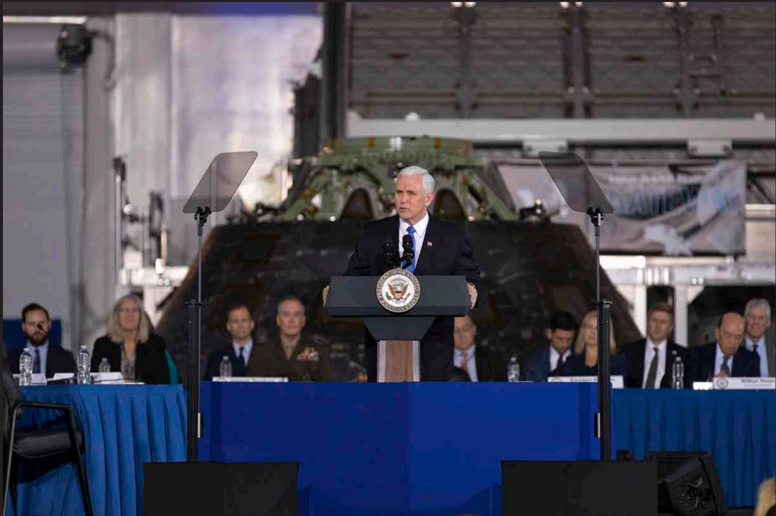
Vice President Mike Pence addresses a meeting of the National Space Council in the high bay of the Space Station Processing Facility at NASA's Kennedy Space Center on Feb. 21, 2018. Chaired by the Vice President, the council's role is to advise the president regarding national space policy and strategy, and review the nation's long-range goals for space activities.

National Aeronautics and Space Administration