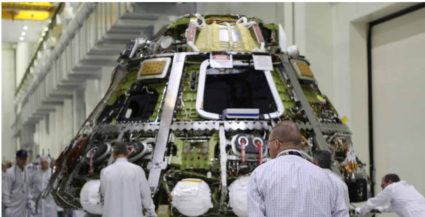
Technicians assist as the Orion crew module for Exploration Mission-1 is moved toward the thermal chamber in the Neil Armstrong Operations and Checkout Building high bay at NASA's Kennedy Space Center in Florida.