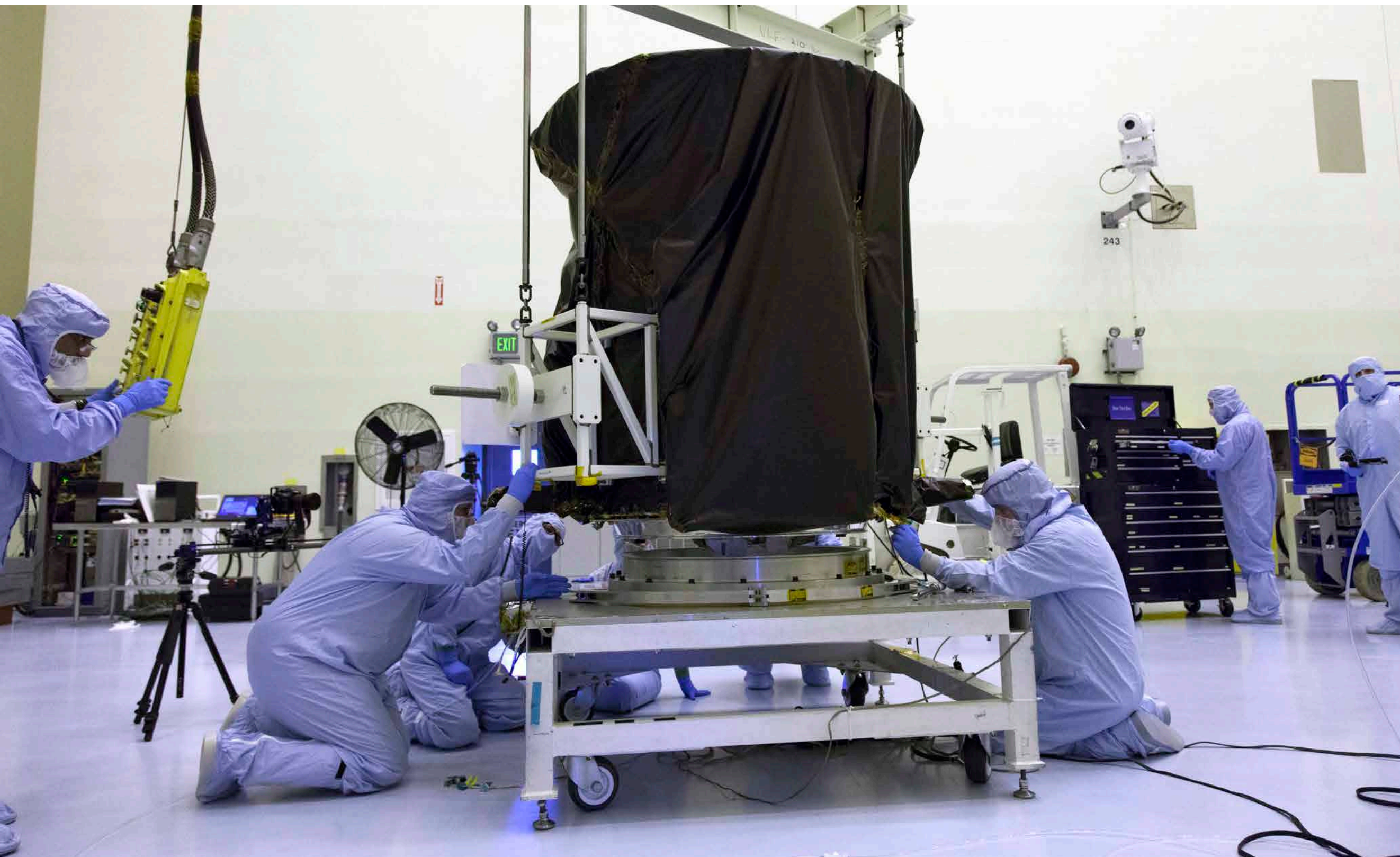
Technicians dressed in clean room suits monitor the progress as a crane lowers NASA's Transiting Exoplanet Survey Satellite (TESS) onto a test stand inside the Payload Hazardous Servicing Facility (PHSF) at Kennedy Space Center on Feb. 12, 2018. Inside the PHSF, the satellite will be processed and prepared for its flight. TESS is scheduled to launch atop a SpaceX Falcon 9 rocket from Space Launch Complex 40 at Cape Canaveral Air Force Station. TESS is the next step in NASA's search for planets outside our solar system, known as exoplanets. TESS is a NASA Astrophysics Explorer mission led and operated by MIT in Cambridge, Massachusetts, and managed by NASA's Goddard Space Flight Center in Greenbelt, Maryland. Dr. George Ricker of MIT's Kavli Institute for Astrophysics and Space Research serves as principal investigator for the mission. Additional partners include Orbital ATK, NASA's Ames Research Center, the Harvard-Smithsonian Center for Astrophysics and the Space Telescope Science Institute. More than a dozen universities, research institutes and observatories worldwide are participants in the mission. NASA's Launch Services Program is responsible for launch management.