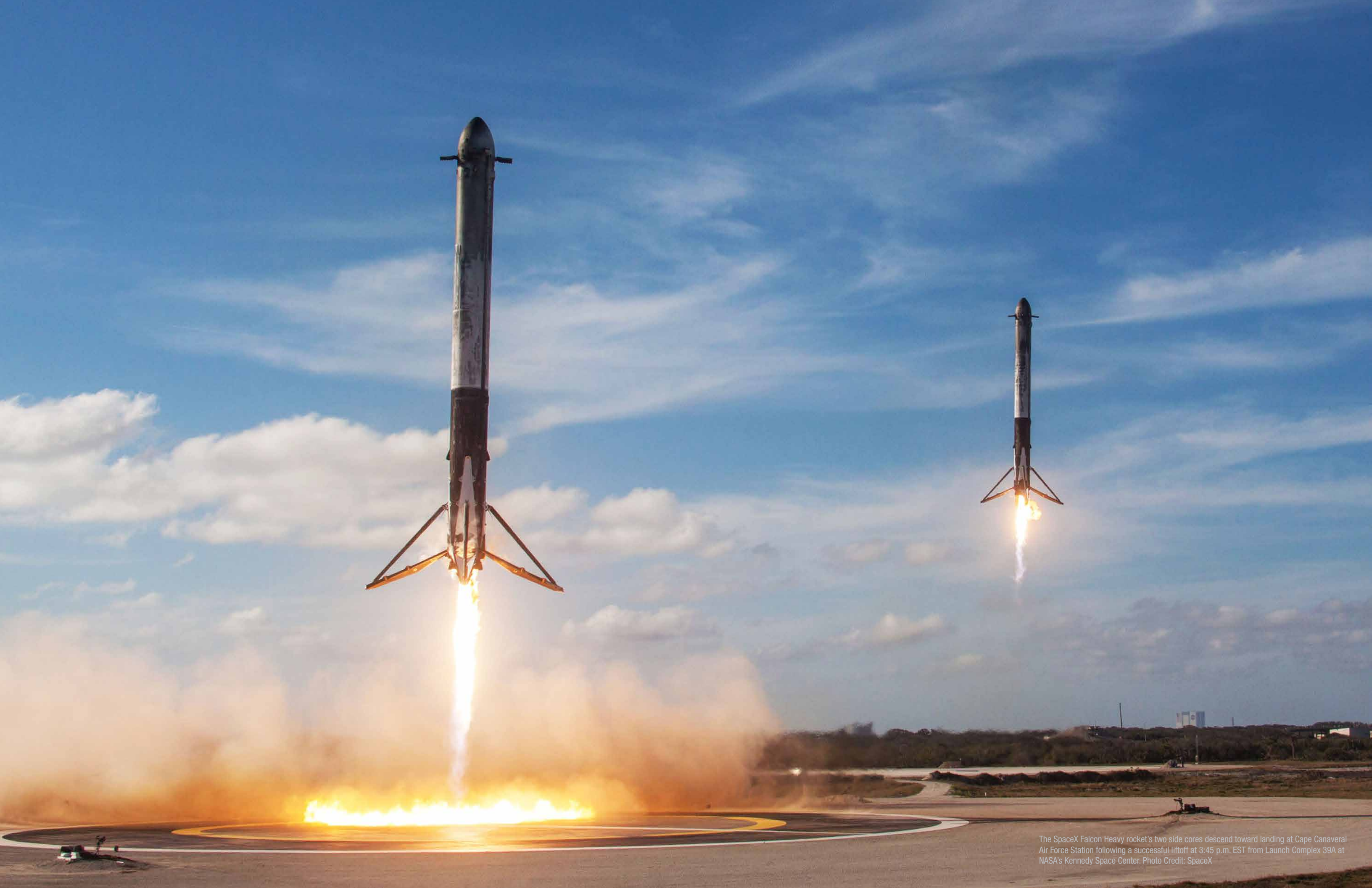
The SpaceX Falcon Heavy rocket's two side cores descend toward landing at Cape Canaveral Air Force Station following a successful liftoff at 3:45 p.m. EST from Launch Complex 39A at NASA's Kennedy Space Center.