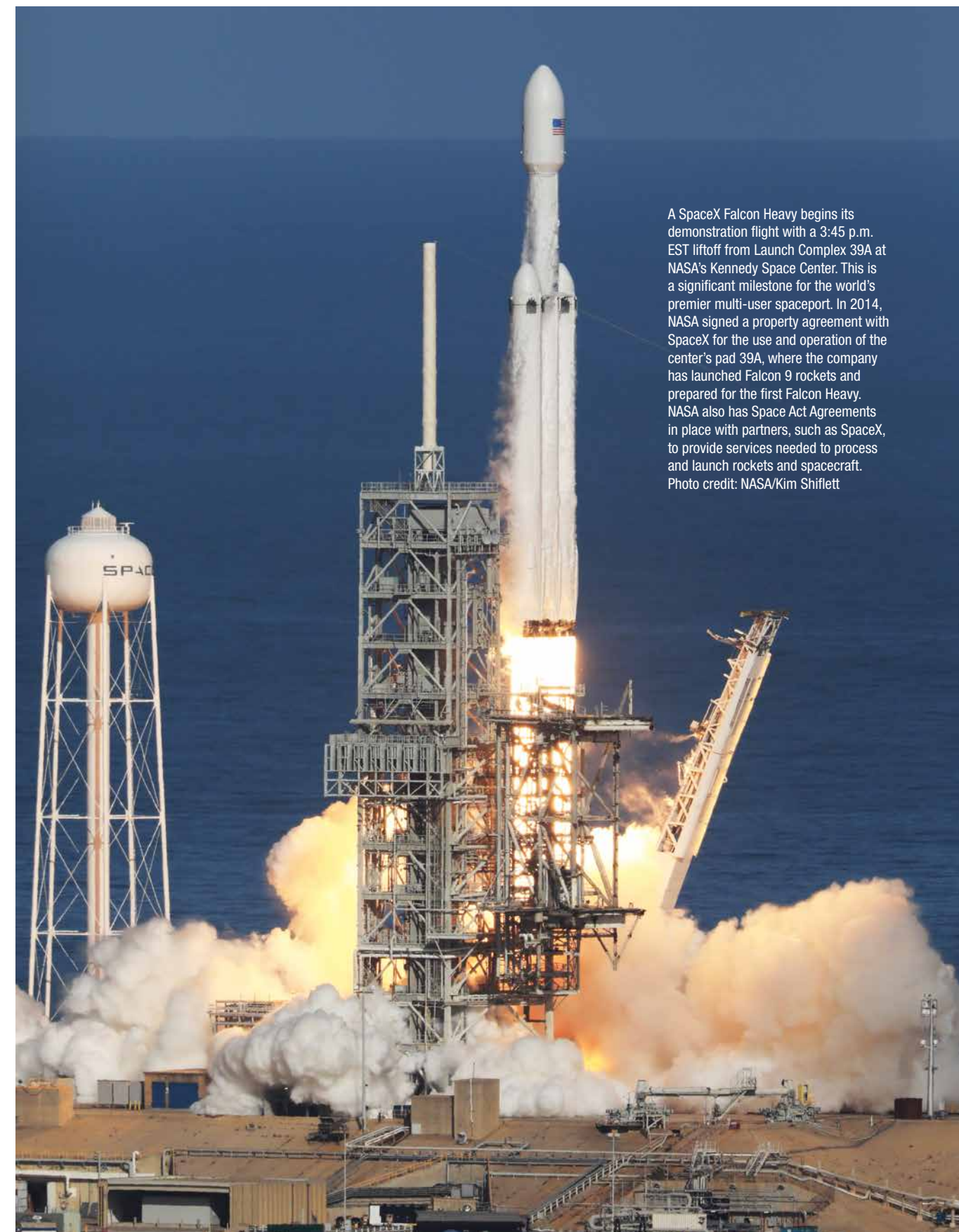
A SpaceX Falcon Heavy begins its demonstration flight with a 3:45 p.m. EST liftoff from Launch Complex 39A at NASA’s Kennedy Space Center. This is a significant milestone for the world’s premier multi-user spaceport. In 2014, NASA signed a property agreement with SpaceX for the use and operation of the center’s pad 39A, where the company has launched Falcon 9 rockets and prepared for the first Falcon Heavy. NASA also has Space Act Agreements in place with partners, such as SpaceX, to provide services needed to process and launch rockets and spacecraft.