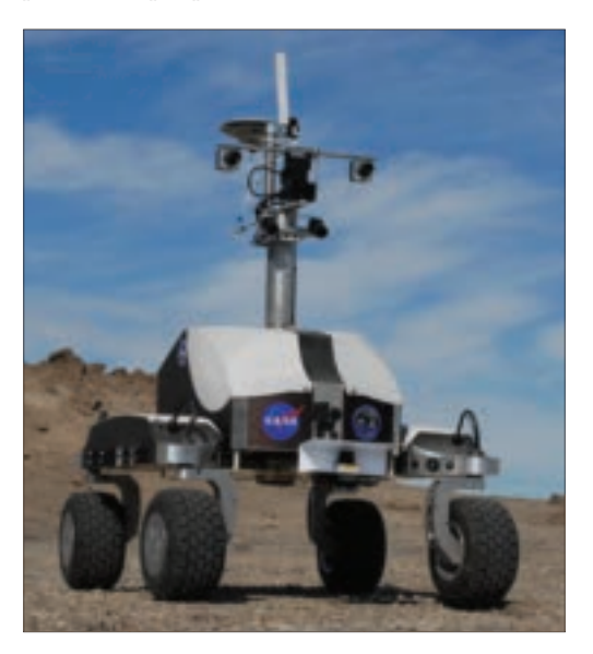
The K10 planetary rover has four-wheel drive and all-wheel steering on a passive rocker suspension, a design that allows operation on moderately rough terrain.

For the near term, Garvin proposes, a continued dialogue among scientists, technologists, engineers, and experienced terrestrial telerobotics/telepresence experts is needed. More workshops, perhaps virtual ones, could help develop specific activities, experiments, studies, and investments to refine the key questions and capability gaps associated with space-based low latency telepresence in specific locations and for particular purposes.