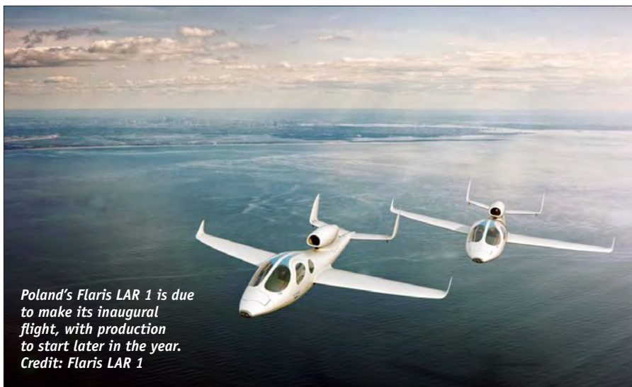
Poland's Flaris LAR 1 is due to make its inaugural flight, with production to start later in the year. Credit: Flaris LAR 1

The SF50 is not the only personal jet in development. Within the next