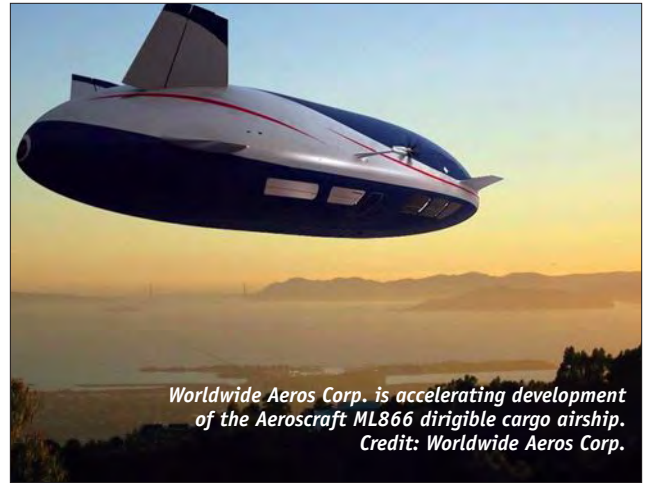
Worldwide Aeros Corp. is accelerating development of the Aerocraft ML866 dirigible cargo airship.

One of these technologies is a control-of-static-heaviness system—a buoyancy management system that