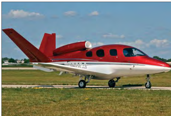
The first Cirrus SF50 built to conform with FAA airworthiness certification is due to fly early this year.

The market for personal and twin-engined VLJs—very light jets—collapsed in the wake of the 2008 financial crisis that engulfed North America and Europe. But the long-term future for these planes is looking more positive, for several reasons: the recent recovery in these markets, the advent of a new generation of more affordable personal jets, and a growing interest in