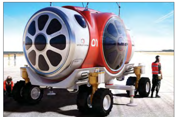
World View Enterprises plans to carry passengers to almost 100,000 feet altitude in a capsule lifted by a balloon.

World View has set up a research and education committee to study the