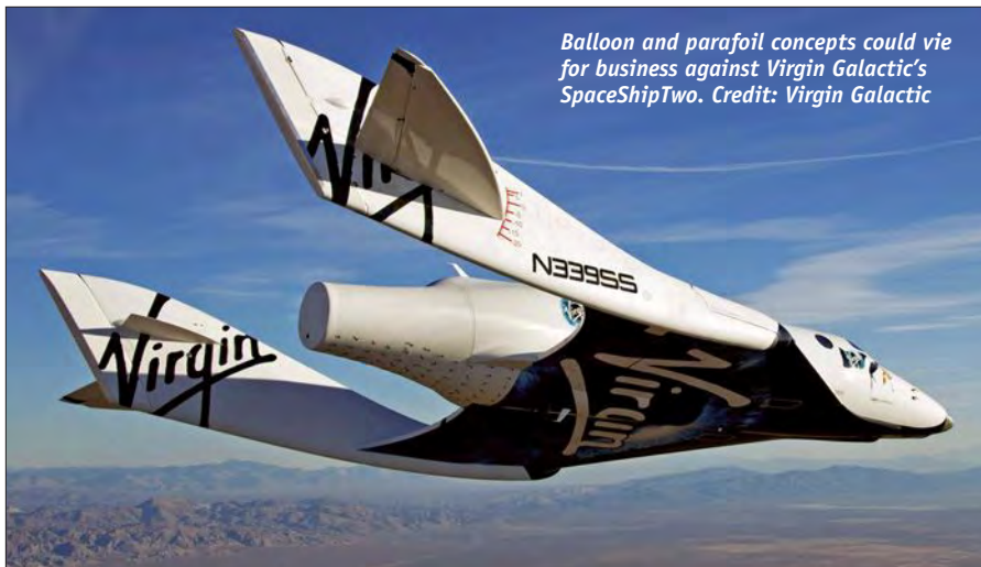
Balloon and parafoil concepts could vie for business against Virgin Galactic's SpaceShipTwo.

Virgin Galactic has a tough schedule to meet if it is to start operations this year. SpaceShipTwo made just two flights in 2013 to test the hybrid rocket motor. On the second flight, in September, the spacecraft reached 65,000 feet and a speed of Mach 1.6, according to a company statement.