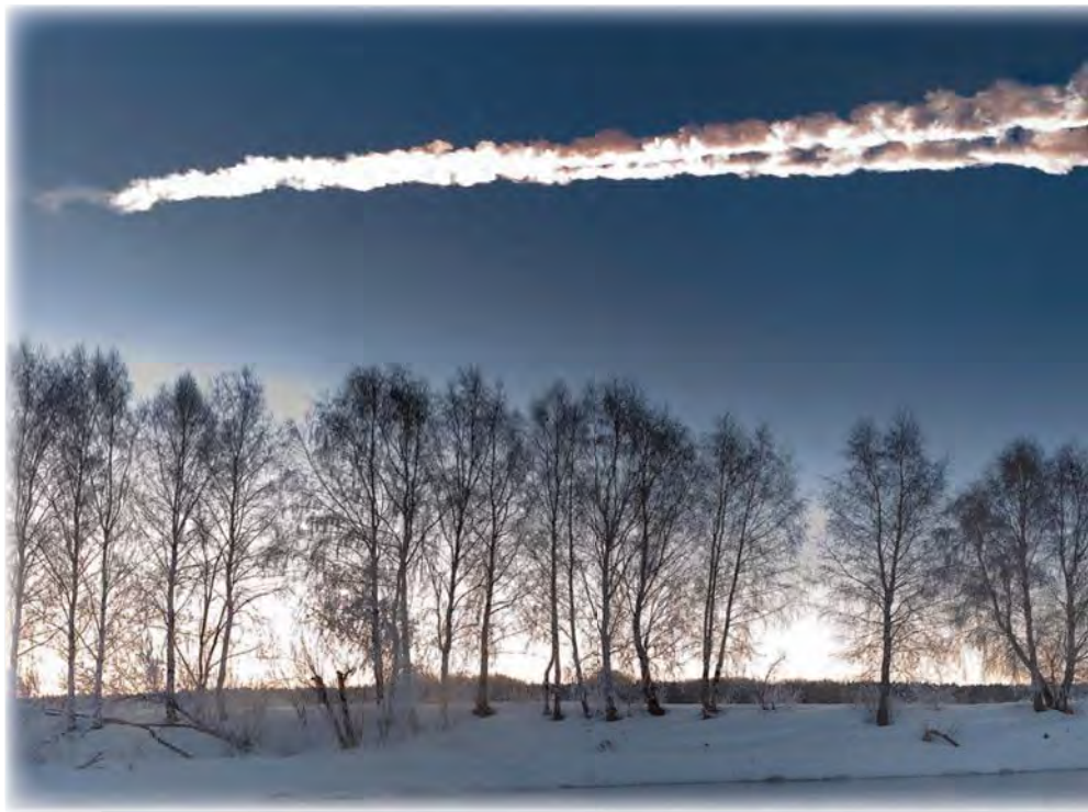
The flash above Chelyabinsk, Russia, from a 20-meter asteroid streaking through the sky on Feb. 15, 2013.