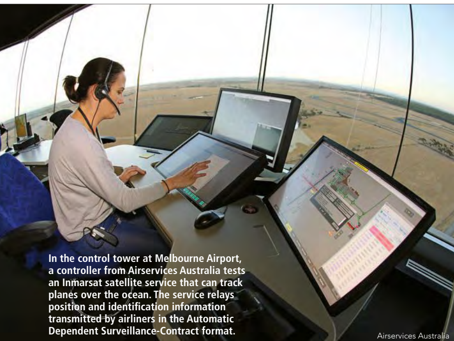
In the control tower at Melbourne Airport, a controller from Airservices Australia tests an Inmarsat satellite service that can track planes over the ocean. The service relays position and identification information transmitted by airliners in the Automatic Dependent Surveillance-Contract format.