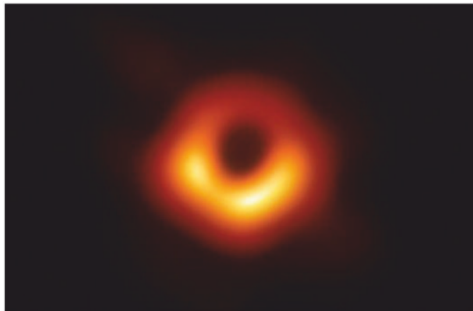
The fuzzy glow of M87's black hole is masking infinite sharp rings of light

Origins would need a few upgrades from its original specifications to perform the measurements required to see the photon rings, including an accurate onboard clock to synchronise observations with those on Earth. "The main difficulty I foresee is the sheer amount of data," says co-leader of the