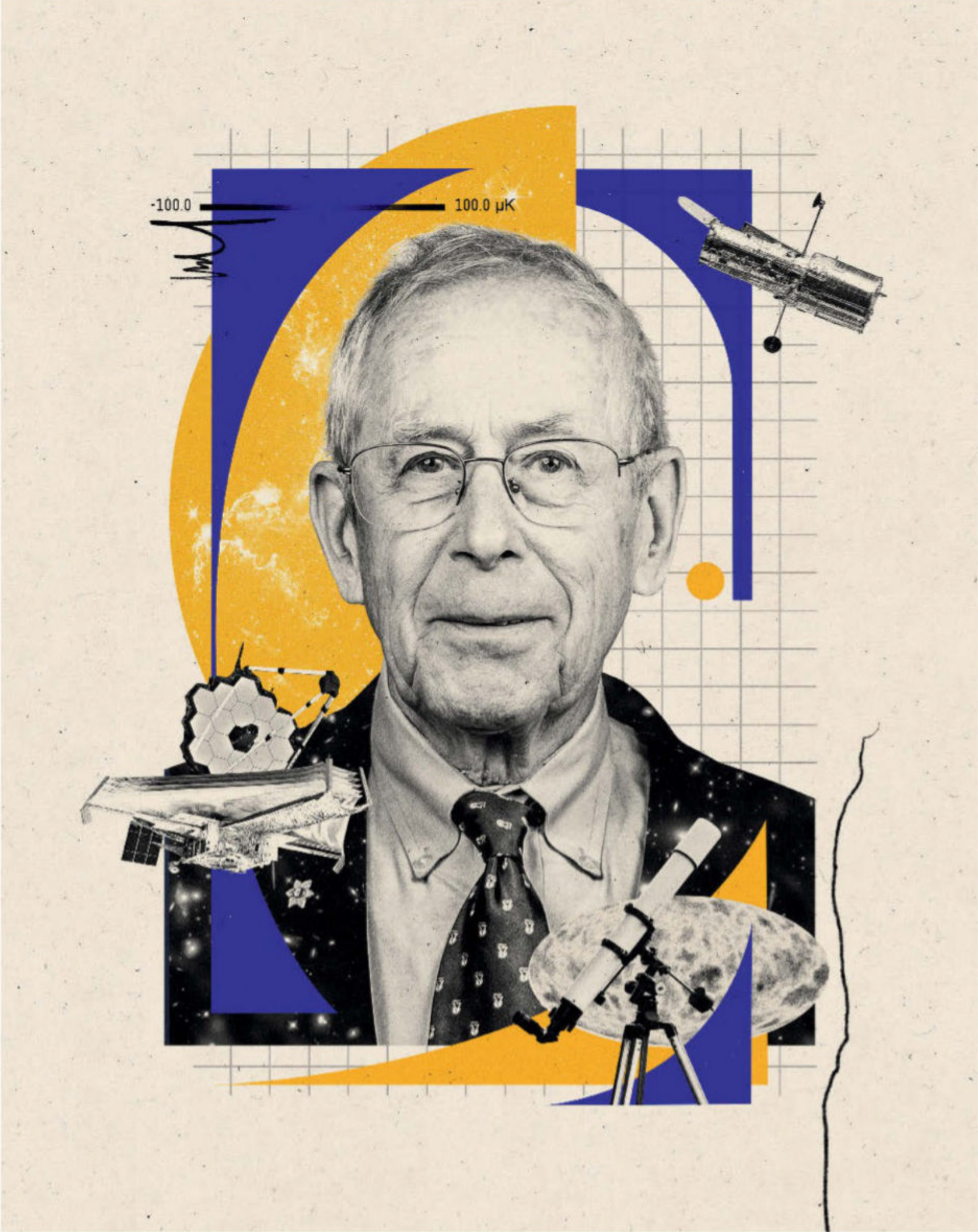
KLAWIE RZECZY: ESA/NASA