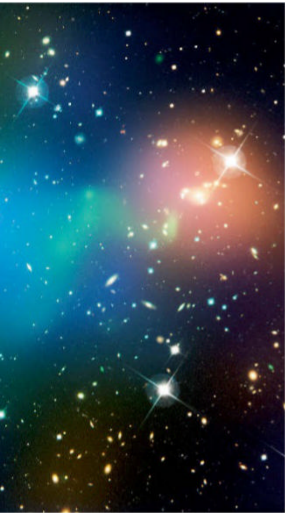
Galaxy cluster Abell 520, with hot gas falsely coloured in green and dark matter in blue

matter and you instead have MOND, how in the world could those predictions have worked so well?