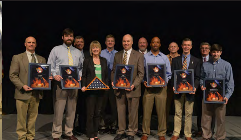
NASA MARSHALL SPACE FLIGHT CENTER