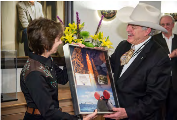
On March 19, Johnson Space Center Director Ellen Ochoa presented the Houston Livestock Show and Rodeo with a belt buckle that traveled 63,000 miles on the first flight of NASA's Orion spacecraft. The presentation showed thanks for their support of the Texas Aerospace Scholars Program.