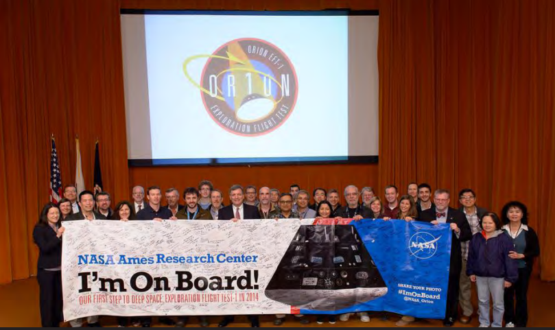
NASA AMES RESEARCH CENTER