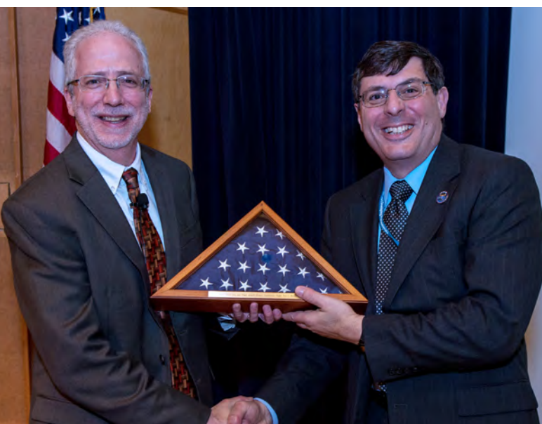
NASA GODDARD SPACE FLIGHT CENTER

Washington (not pictured); Systema Technologies in Bothell, Washington; Janicki Industries in Sedro-Woolley, Washington; NASA's Michoud Assembly Facility in New Orleans; NASA's Marshall Space Flight Center in Huntsville, Alabama; United Launch Alliance in Decatur, Alabama; NASA's Langley Research Center in Hampton, Virginia; NASA's Goddard Space Flight Center in Greenbelt, Maryland and NASA Headquarters in Washington, D.C.