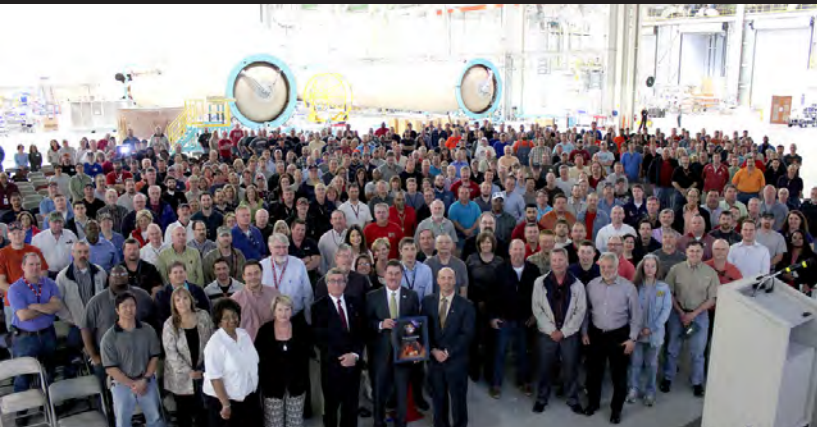
UNITED LAUNCH ALLIANCE-DECATUR