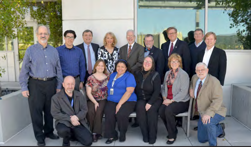
NASA JET PROPULSION LABORATORY