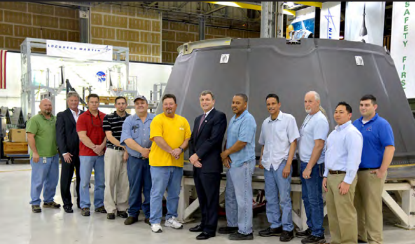
NASA MICHOU D ASSEMBLY FACILITY