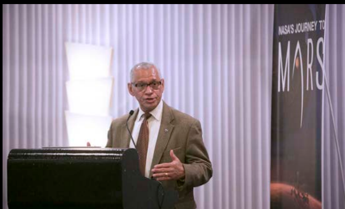
NASA Administrator Charles Bolden addressed industry suppliers to provide them an overview of NASA's Journey to Mars exploration plans and thank them for all their hard work in building the spacecraft and systems needed for America's space program.